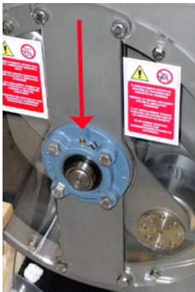
Fig. 2. Bearing