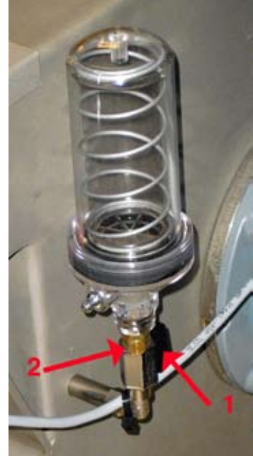
Fig. 1. Auto Dispenser. Open both the ball valve (1) and the thumbscrew valve (2) during operation.